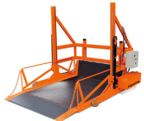
Table Size -2000 - 1600 mm